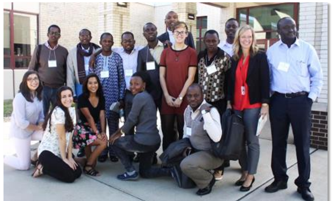
Avonworth High School Students Meet African Journalists in the Program Entitled, "Election Press Coverage", Sept. 2015